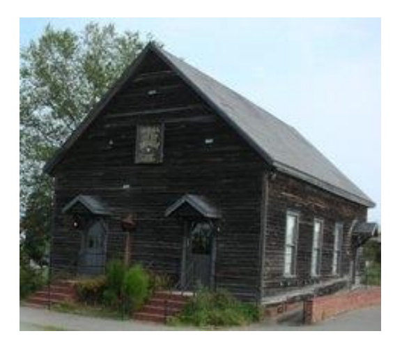
Georgia State Cotton Museum

In 1908, the United Daughters of the Confederacy erected a monument to the soldiers of the Confederacy. It is located in the Downtown Square.