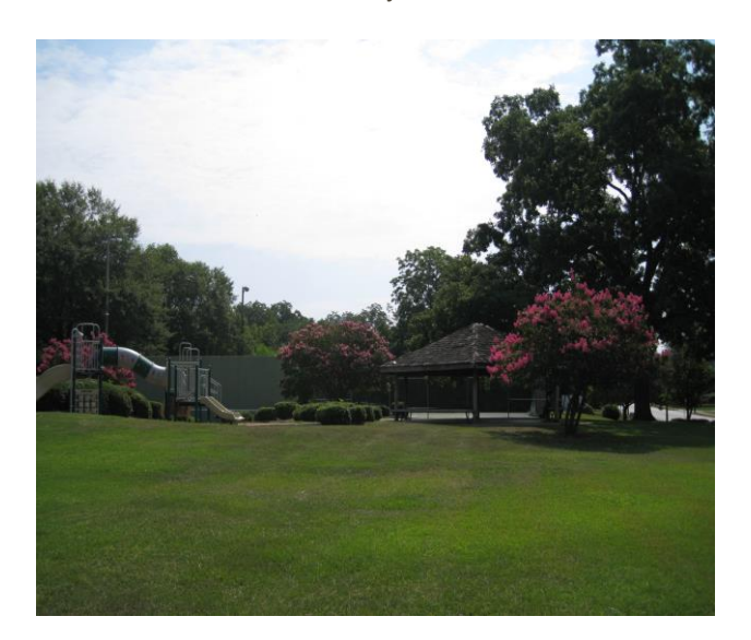
George Busbee Park and Tennis Courts

Barbeque is not our only call to fame. You can delve into a rich history and culture to learn about Vienna's most notables – from Hollywood screen writer, an Olympic athlete, governors, senators, poets, authors, and artists. Vienna has produced its share of unique and famous individuals. Some of their homes still exist today.